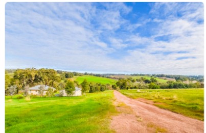
6 Sunridge Drive, Bridgetown