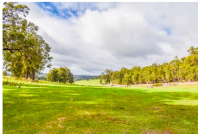
Lot 11294 Hester Hall Rd, Hester Brook