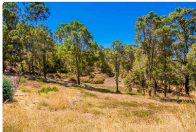
24 Geegelup View, Bridgetown