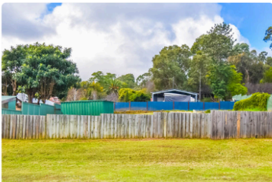
1B Brockman St, Bridgetown