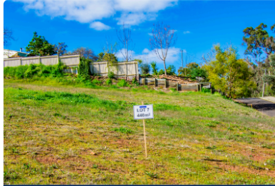
7/22 Somme St, Bridgetown