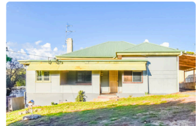
12 Barlee Street, Bridgetown