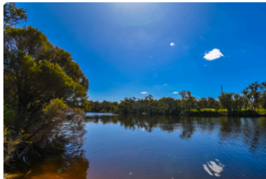
Lot 50 Eulin Crossing Rd, Kulikup