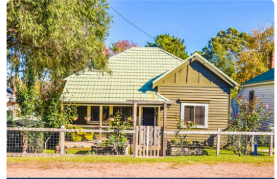
11 Hampton St, Bridgetown