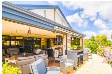
25 Democrat Close, Kangaroo Gully