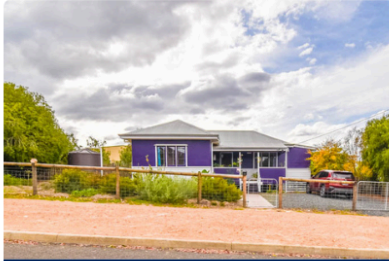
26 Barron St, Boyup Brook