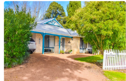
33 Roberts Street, Balingup